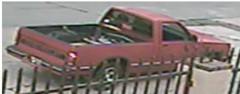
Suspects and Suspect Vehicle